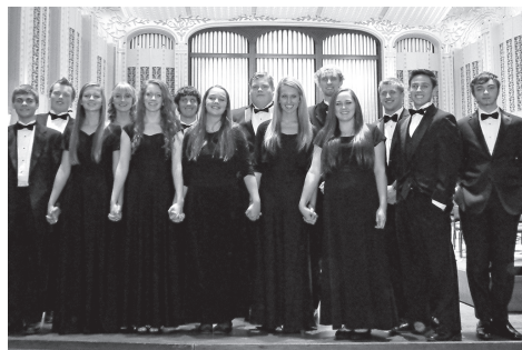
PHS band members performing recently at Severance Hall for the 25th anniversary of the Cleveland Youth Wind Symphony are: